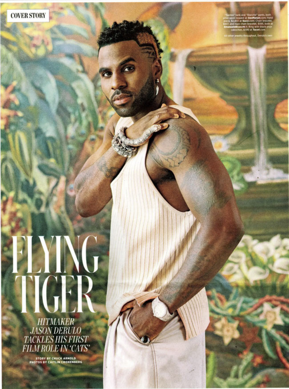
"Santorini" tank and "Blanche" pants, both priced upon request at Santorini.com ; band price, $2,850 at Gucci.com ; Chain bracelet, $127; and rope chain bracelet, $165, both at EmmanuelBecchetti.fr ; Ring with black onyx cabochon, $190 at Taccori.com . All other jewelry throughout, Derulo's own.