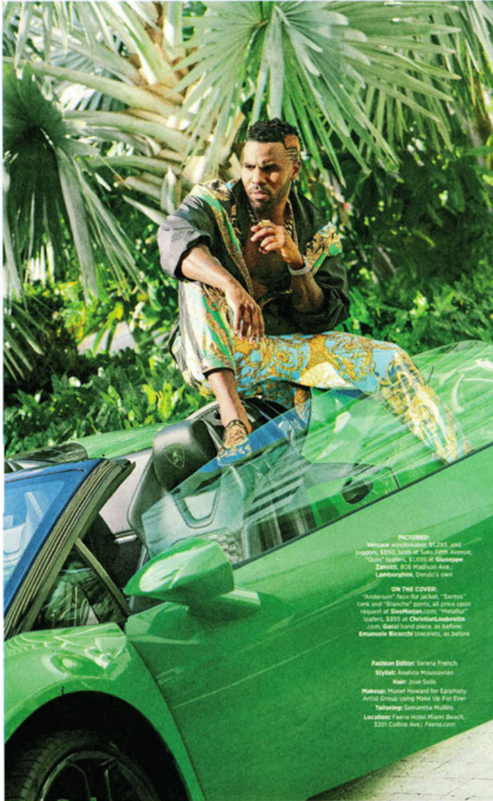
PICTURED: Wetuase; watchband, $725, and rings, $200, both at Saks Fifth Avenue; "Gucci" jacket, $1,695 at Glossop; Zanussi, 806 Madison Ave., Lansburgh; Derulo's own

"You have to make mistakes, you have to fall on your face to become the person that you dream of," he continues. "There's no better teacher than feeling the pain yourself."