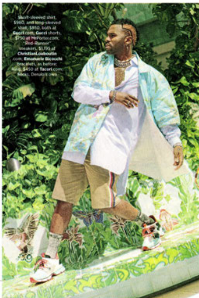
Short-sleeved shirt, $100, and long-sleeved shirt, $450, both at Gucci.com ; Gucci shorts, $790 at Mercurio.com ; Band bracelet, $190; Sneakers, $119; at ChristianLouboutin.com ; EmmanuelBecchetti bracelet, as before; Ring, $450 at Taccori.com ; Photo, Derulo's own.