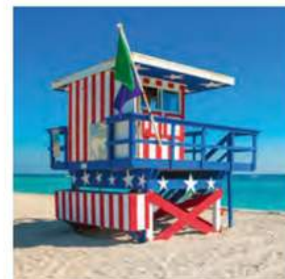
Clockwise from top: The incredible street art in Wynwood; patriotic lifeguard huts on South Beach; the bold architecture of SLS Brickell