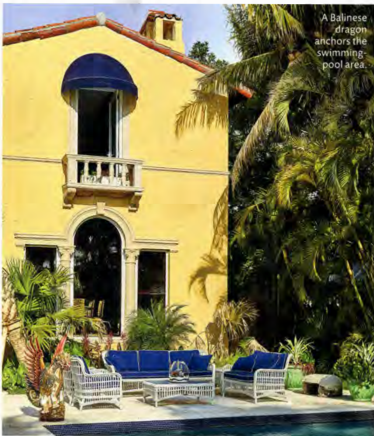
A Balinese dragon anchors the swimming-pool area.