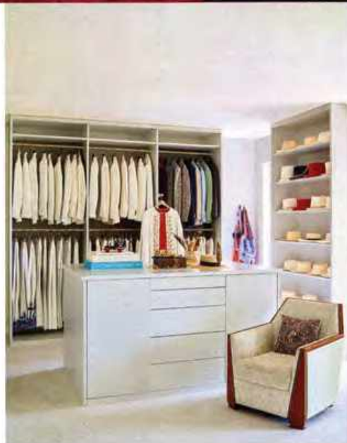
➤ Faena's hat collection is on display in his master bedroom closet.